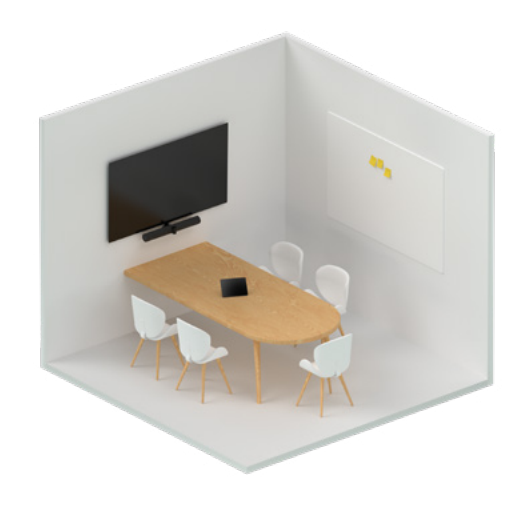
More inclusion. More collaboration.